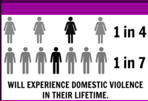
Emergency Shelter Programs